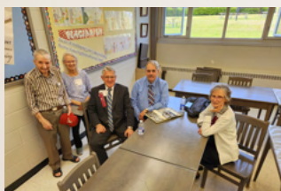
Class of 1963