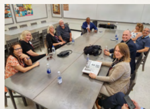
Class of 1983

Alumni weekend seems to always be a whirlwind, to those of us that work at Kingsway College. There is so much planning that goes into 3 days, and it seems as if you blink, it's over.