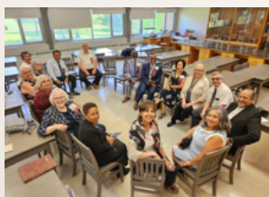
Class of 1973