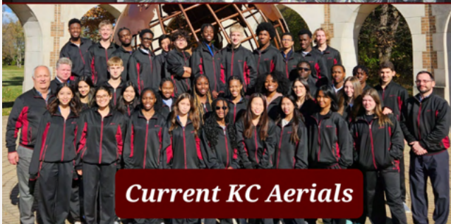
Current KC Aerials